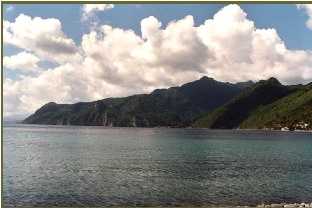
Soufriere Bay at Scotts Head, Dominica